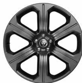
20" VARUNA TECHNICAL GREY