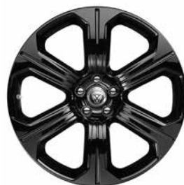
20" VARUNA GLOSS BLACK