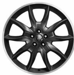
20" DRACO DARK FINISH [DIAMOND TURNED RIM]