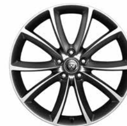
17" URSA IN GLOSS ANTHRACITE GREY