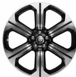
20" VARUNA R-S DARK POLISHED